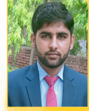
Vikrant CSB Bank