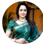
MRS. HEMA MALINI Member of Parliament